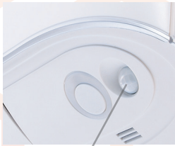
Intelligent eye sensor

Daikin single and multi-zone systems offer SEER options up to 27.4 and state-of-the-art technology to help with efficiency. In addition to low operational sound levels, Daikin inverter technology also allows the system to deliver the capacity required to maintain the desired room temperatures. This function typically reduces energy consumption by up to 30% or more (compared to traditional fixed-speed ducted systems).